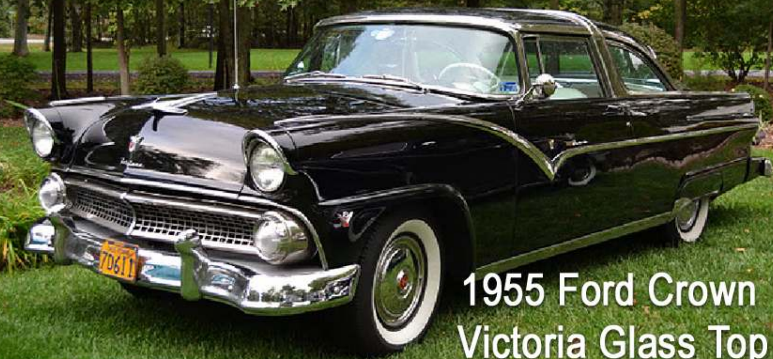
1955 Ford Crown Victoria Glass Top