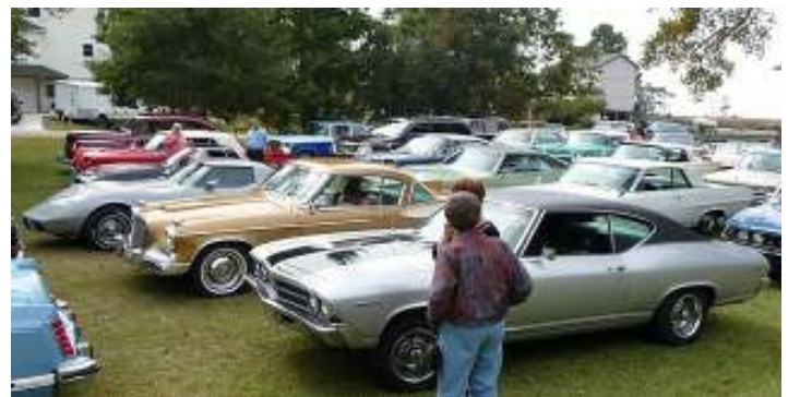
Some of the cars on the Fall Tour at the Tilletts.