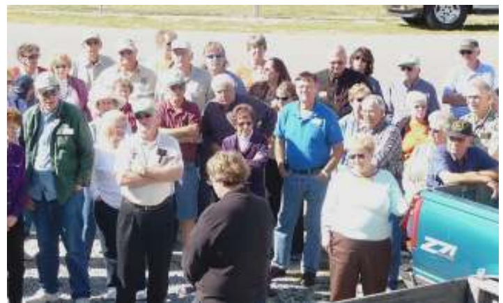
Some of the tour participants at Blackwell Boat Works.